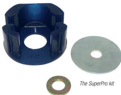
The SuperPro kit

The two SuperPro part numbers (SPF2861-80K and SPF3365-80K) cover the following models: