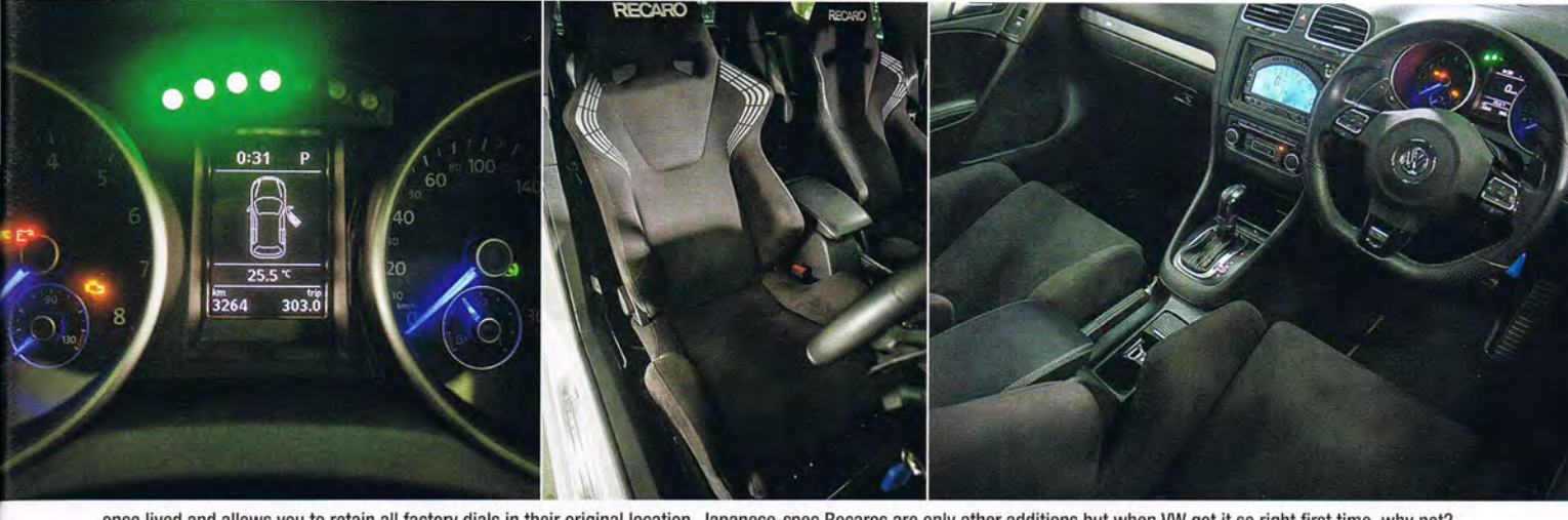
once lived and allows you to retain all factory dials in their original location. Japanese-spec Recaros are only other additions but when VW got it so right first time, why not?

"These engines, whilst comparatively making more power than their Golf R brothers have an issue pulling Gs around corners," Guy continues. "To allow for the deficiencies in the oiling system we run a drain to sump catch can and an 'Accusump' which is a secondary pressurised oil system. To fit in a three-quart system, the easiest way we could do this was relocate the battery to a secure box located in the boot."