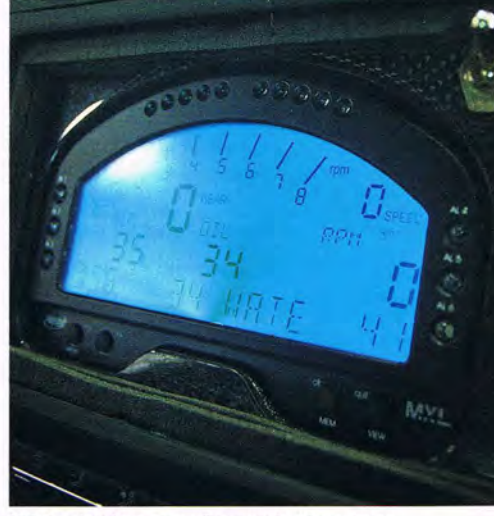
AIM data logging system fits snuggly where stereo

sledge hammer-like 700Nm. All the figures I'm going to be quoting are dyno hub proven too, so put the doubt away.