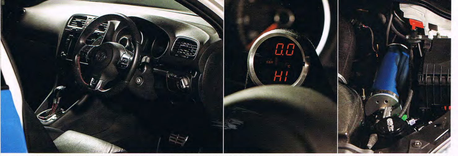
APR never upgrade stuff just for the sake of it; if it's added then it's purposeful. GTI trim is virtually bone-stock - all bar boost controller. It's a similar story under the bonnet, too

obvious. He's instilled decades of experience in to the builds, and that's what I'm looking for.